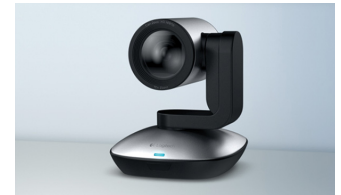
Sitting on table or ledge