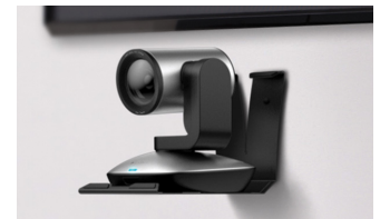
Mounted on wall

For an even easier connection experience, quickly pair NFC-enabled mobile devices to the CC3000e by simply touching them together. And whether the user connects with Bluetooth ® or NFC, the CC3000e is programmed to remember only the last mobile device it was paired to for security and convenience.