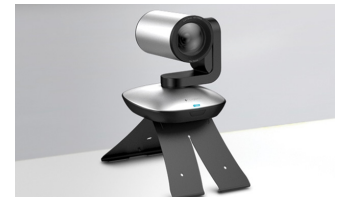
Elevated to eye height